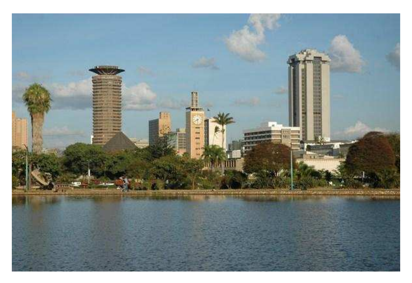
A view of Nairobi, Kenya.